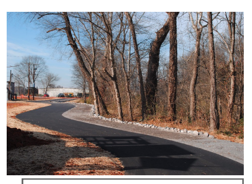
Newly paved section on Moravian Creek

Phase III, Segment I (Smoot Park/Memorial Park) part of the YRG is now an active project. In July of 2010, the Town of North Wilkesboro was awarded a matching grant of $197,400.00 from the North Carolina Department of Water Resources. The YRG in conjunction with the Town of North Wilkesboro had applied for this grant for the construction of this trail segment. Preliminary engineering is underway to define the proposed trail in more detail. The "No-Rise" flood study and Erosion Control Plans will be prepared by Blue Ridge Environmental Consultants and they will commence this work in early 2011. Design work is schedule to continue through the spring of 2011 with an early summer construction start-up anticipated. This segment of the Greenway is anticipated to be a significant one, as it will connect the two parks in North Wilkesboro and add 1.2 miles of Greenway trail to the total completed. If all proceeds as planned, this new segment should be completed by the end of 2011.