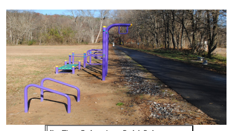
New Fitness Equipment near Becky's Park

In addition to the 7 miles of trail, the Yadkin River Greenway Council has developed a new opportunity to improve fitness this year through a partnership with the YMCA. Next to Becky's Park, six exercise stations have been installed and an additional station will soon be added.