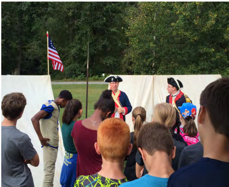
Re-enactors from the OVTA present demonstrations along the Greenway on September 29th for Wilkes County students

On September 29, Over 600 students, teachers and volunteers from Wilkes County Schools joined the Overmountain Victory Trail Association (OVTA) re-enactors on the Yadkin River Greenway for a day of experiencing history up close.