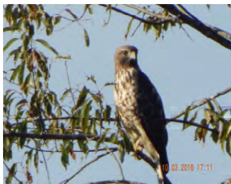
A Hawk's view!!