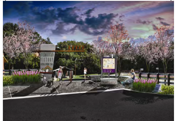
The above graphic is one of many design concepts contained in the Overmountain Victory Trail

Contained in the Master Plan are design concepts which provide visually pleasing improvements created by signage and landscaping along overpasses, bridges, trail heads, and informational kiosks in the Communities from Elkin to W. Kerr Scott Dam. In addition, the Master Plan identifies potential areas where the trail might pass through the communities along the Yadkin River near NC Highway 268 from Elkin to W. Kerr Scott Reservoir. The Yadkin River Greenway contains several Park Service Certified sections of the Overmountain Victory Trail.