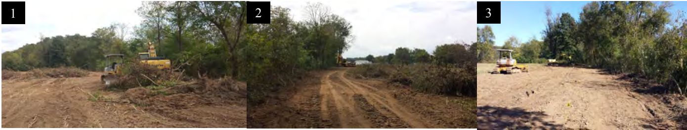
The site preparation above shows the clearing of brush and grading of the surface.

These photos were taken in October of 2016 and show the initial construction of a new Greenway segment near Memorial Park in North Wilkesboro. Construction funds were provided by a National Park Service grant source “The Outdoor Foundation.” The Yadkin River Greenway is working with the Town of North Wilkesboro to complete this project. Construction will commence as soon as plans, permits, grants and funding are in place.