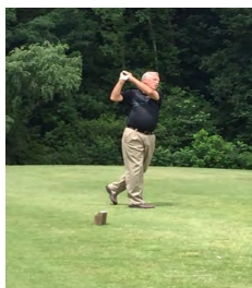
A golfer tees off!