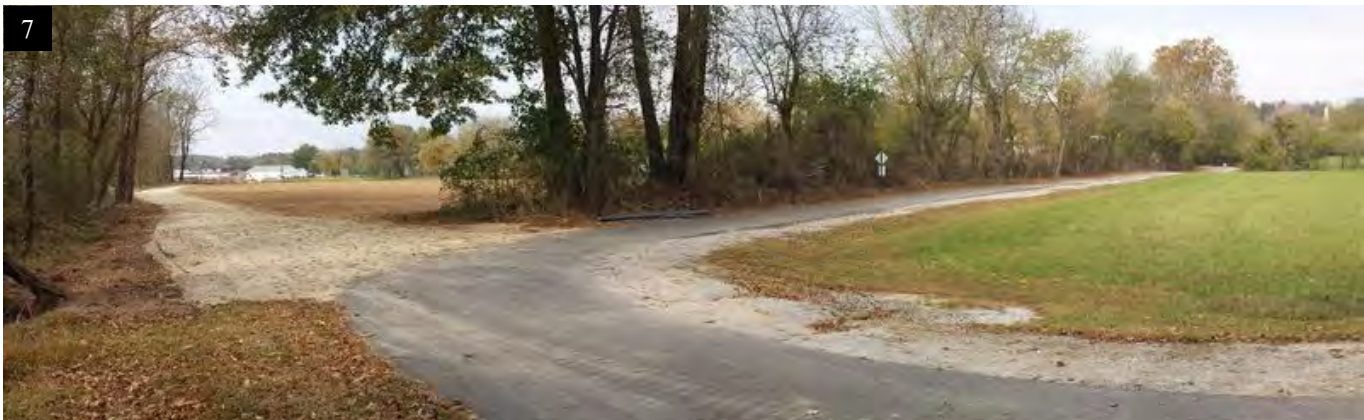
The above photo shows the location of the intersection of the existing Memorial Park to Smoot Park Greenway Section.