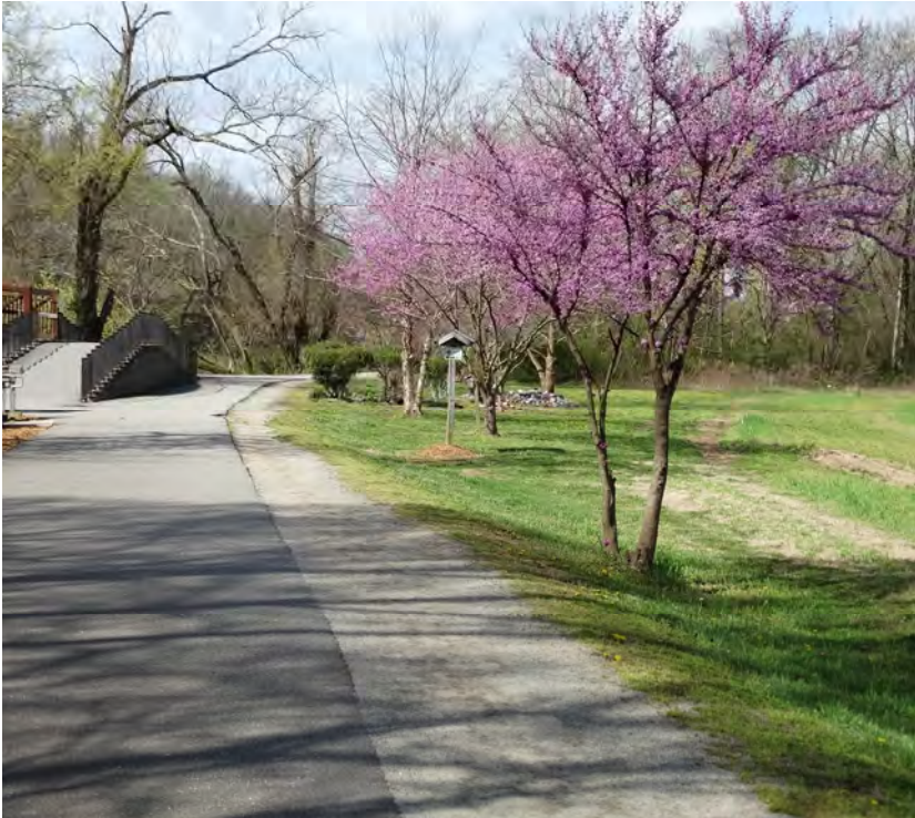
The Arrival of Spring