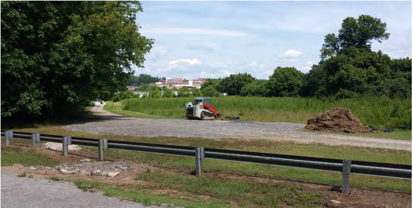
Bus Turnaround Area at the end of Willow Lane along the Greenway

The National Park Service provided a $5,000.00 grant to construct a bus turnaround area on the Yadkin River Greenway near Willow Lane in North Wilkesboro. The bus parking lot will allow buses to bring students attending educational programs about the Overmountain Victory trail during the annual reenactment march to Kings Mountain, South Carolina. On September 29, 2016, an estimated 600 Wilkes County Students attended programs on the greenway conducted by the Overmountain Victory Trail Association re-enactors who, while dressed in period clothing of the American Revolutionary War, told the story of the Historic Battle of Kings Mountain.