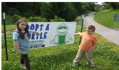
Gearing up for the Regatta!!!