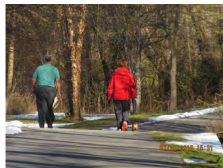
A Winter Stroll!

Don't forget to bring your camera or phone camera!!