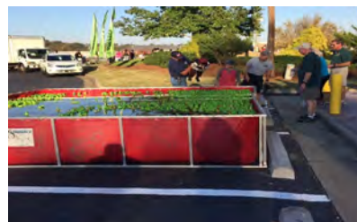
Turtles Awaiting the Drawing!!