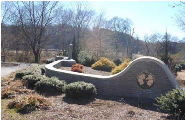
The Yadkin River Greenway Recognition Wall

Certain levels of memorials and honorariums also qualify for naming opportunities on the recognition wall our on mileage markers located along the greenway. If you are interested in setting up a memorial, you can contact our office at 336-651-8967.