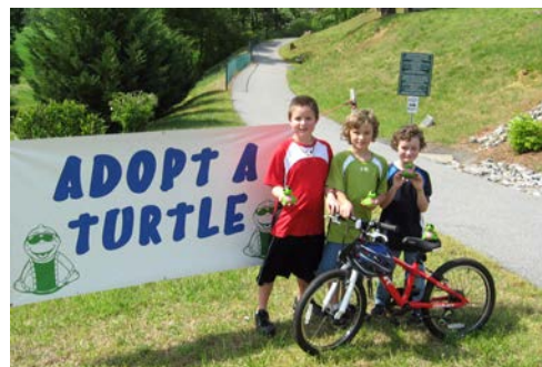
Gearing up for the Regatta!!!

Our 9th annual Turtle Regatta was held the third Saturday in May. Over 1,000 toy turtles were adopted and floated down the Reddies River at "crawl speed" (which is appropriate for a turtle). A large variety of prizes were awarded, with first place being a bicycle donated by Cook's. The event raised nearly $9,000 for the Greenway.