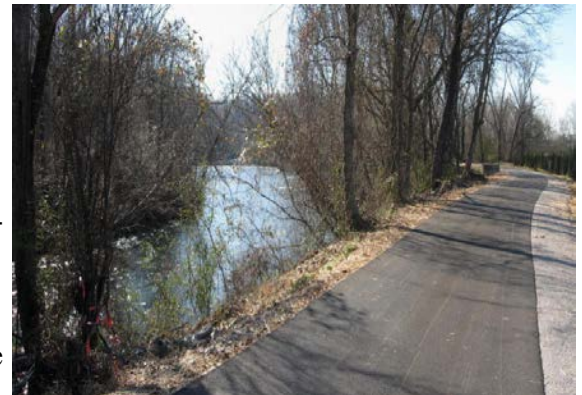
A view of The Yadkin River Greenway On the new Smoot to Memorial Section!!

I would like to thank, and compliment, our board and committee chairpersons for their tireless service and hard work. Their reports will detail those efforts shortly.