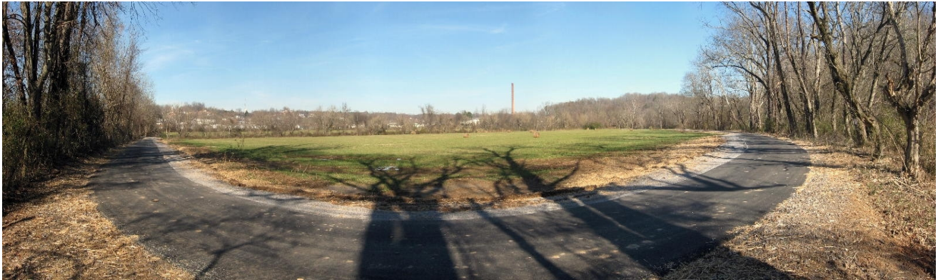
Panned View of Smoot to Memorial