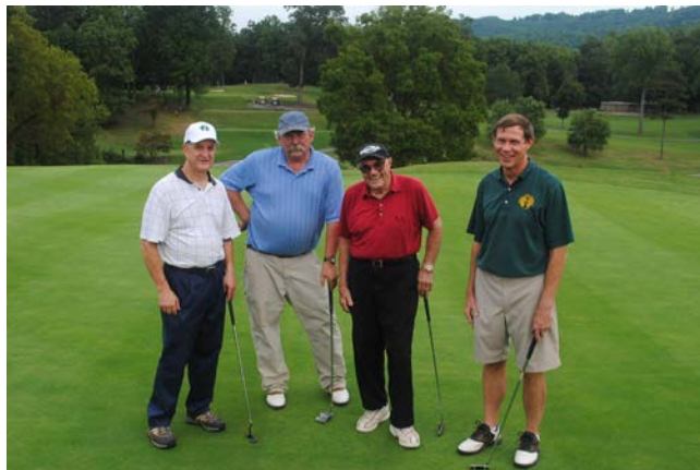
A smiling four player team pauses during our 2011 Golf Tournament

Thursday September 22 was the date of our 8th annual Yadkin River Greenway Benefit Golf Tournament, held at Oakwoods Country Club. Participants enjoyed a great round of golf on what turned out to be a beautiful day. Thanks to participants and generous sponsorships from local businesses and individuals, we raised $5,000 for the Greenway.