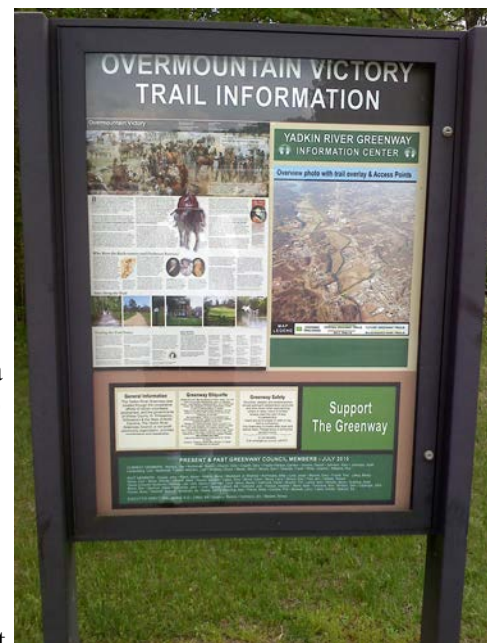
Kiosk near the Coffee Tavern Trailhead Installed by Sign Factory Direct