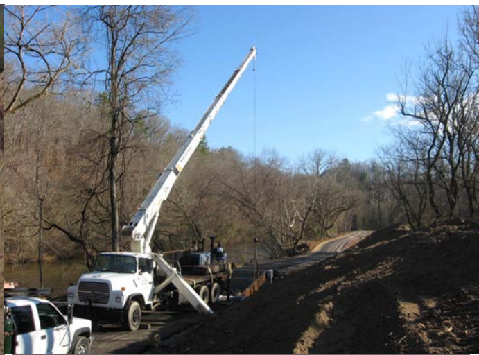
A crane is used to install the support beams

The new bridge shown at right in photo is ready for the flooring - installation of Ipe Wood, also called Paulope, Ironwood, or Brazilian Walnut Wood (visible in below photo)