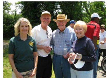
A Greenway Moment at the Regatta!!!