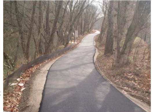
Newly paved section near Smoot Park. Paving was carried out by Carl Rose and Sons Paving

2011 has brought about a significant level of construction activity for the Yadkin River Greenway. The most significant project undertaken during 2011 has been Phase III, Segment 1 (Smoot Park/Memorial Park) portion of the Yadkin River Greenway. In 2010, the Town of North Wilkesboro and the Yadkin River Greenway were awarded a matching grant of $197,400.00 from the NC Department of Water Resources for construction of this segment. Subsequently, this spring of 2011 the Town of North Wilkesboro and Yadkin River Greenway received an additional grant from the NC Department of Environment and Natural Resources, Division of Parks and Recreation for an additional $197,400.00. This PARTF grant was also a matching award. As a result, the two (2) grants met the requirements of the matching funding and provided the Yadkin River Greenway and the Town of North Wilkesboro with a total of $394,800 for the construction of the Smoot Park to Memorial Park segment. After procuring all of the necessary engineering design and permitting, the Yadkin River Greenway in conjunction with the Town of North Wilkesboro was able to commence construction of this segment in July of 2011. The majority of this segment is now complete as of the end of 2011. Some minor signage work and miscellaneous items are remaining. The addition of the 1.2 mile segment between Smoot Park and Memorial Park is another beautiful addition to our overall Greenway system.