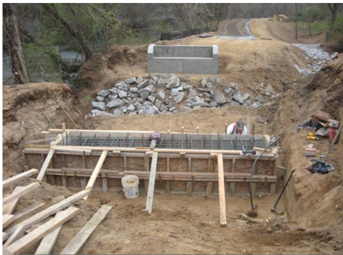
Concrete footings and rebar are installed